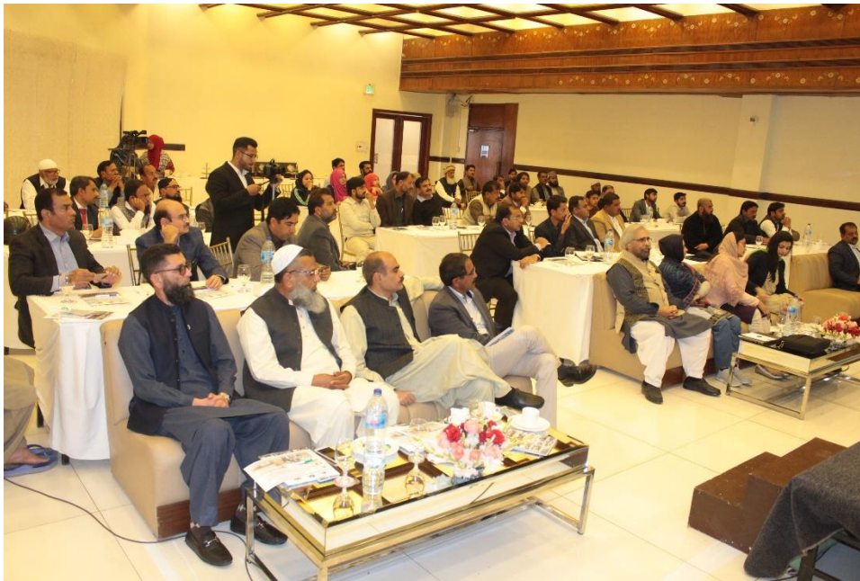
Seminar at Hotel Ramada, Multan, 15 FEB, 2020 “In-Pond Raceways System (IPRS) Technology; Innovative Solution for Sustainable Commercial Aquaculture in Pakistan”. Stakeholders from Aquaculture industry, fish feed mills, academia and Department of Fisheries, Punjab participated.

and its feasibility in Pakistan. A total of eighty guests participated in this seminar belonging to fish farming, potential investors, Department of Fisheries, Punjab, Fish Feed industry and universities.