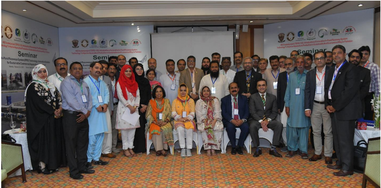
Seminar at Hotel Avari Towers, Karachi, 24 FEB, 2020 “In-Pond Raceways System (IPRS) Technology; Innovative Solution for Sustainable Commercial Aquaculture in Pakistan”. Group photo of all participants in the seminar.