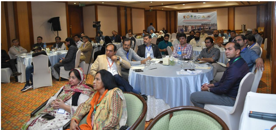
Seminar at Hotel Avari Towers, Karachi, 24 FEB, 2020 “In-Pond Raceways System (IPRS) Technology; Innovative Solution for Sustainable Commercial Aquaculture in Pakistan”. Stakeholders from Aquaculture industry, fish feed mills, academia and Department of Fisheries, Sindh participated.