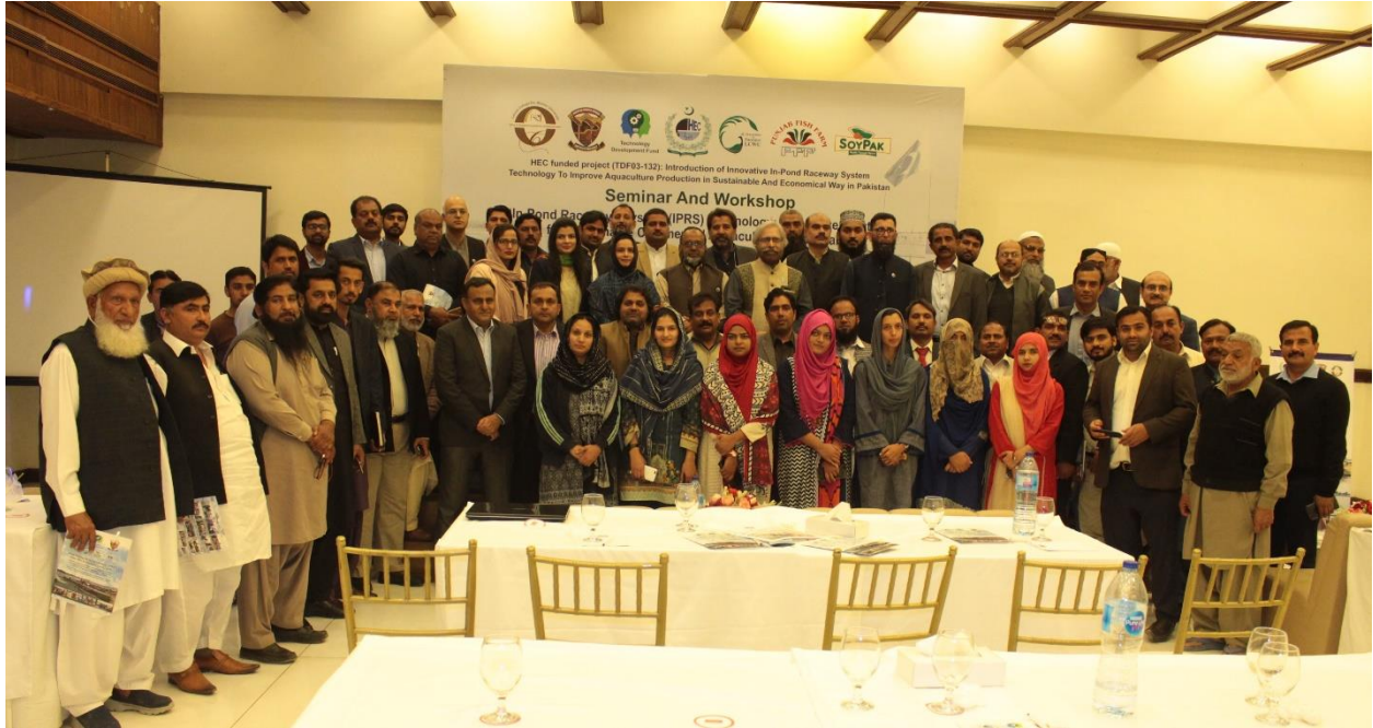
Seminar at Hotel Ramada, Multan, 15 FEB, 2020 “In-Pond Raceways System (IPRS) Technology; Innovative Solution for Sustainable Commercial Aquaculture in Pakistan”. Group photo of all participants in seminar.