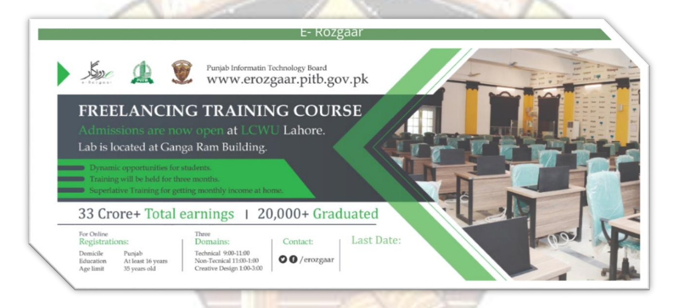
The E-Rozegar lab conducts workshops and trainings across the country and world.